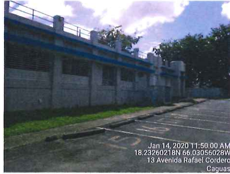
Figura 1:Edificio escolar con columna corta.